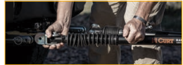
Patent-pending, non-binding latches for easy release on inclines, declines and turns