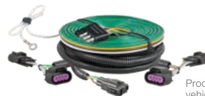
Product varies by vehicle application