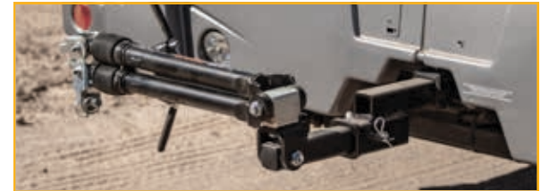
Fully sealed design and rubber sleeves protect against dirt and debris