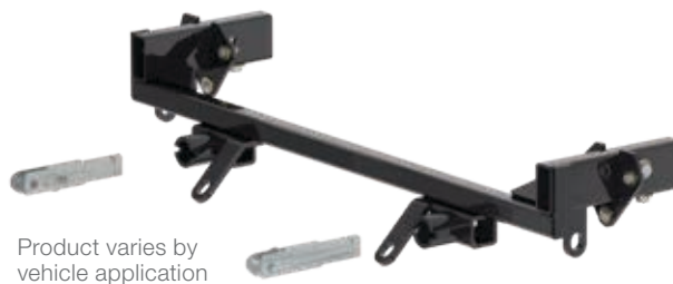
Product varies by vehicle application