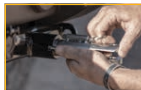
Twist-lock tabs for easy installation and removal